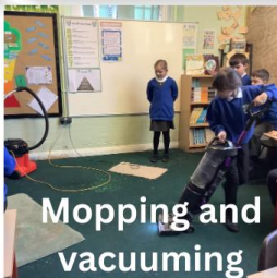
Mopping and vacuuming