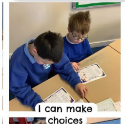
I can make choices