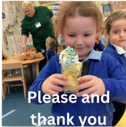
Please and thank you