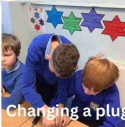
Changing a plug