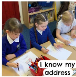
I know my address